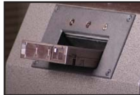
Tape Cartridges DLT, LTO, 8mm