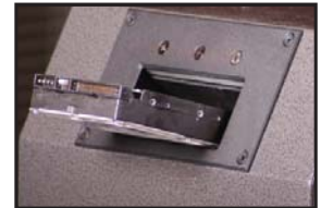
Standard Hard Drives

The HD-3WXL now has an LCD Display to visually provide the user with erase, power and mode verification. Information includes: