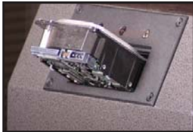
Large Hard Drives